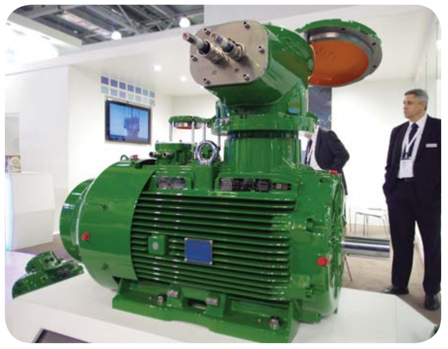
A WEG EExd motor.

requirements regarding 2-3% harmonic voltage factor (HVF), due to the effects of harmonics on winding temperature. IEC 60079-1 (hazardous area equipment) however does not currently have any requirement for HVF regarding compliance testing or certification for any explosion-proof motor protection concepts. It is a similar situation for NEMA/UL explosion-proof motors under standard MG-1.