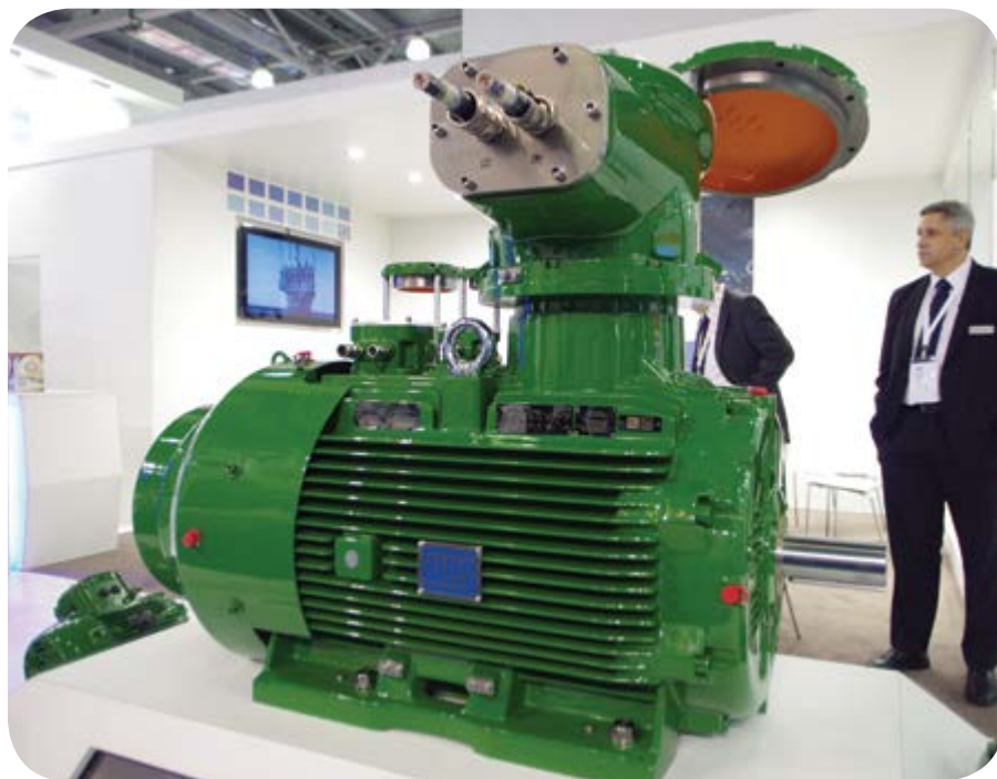
A WEG EExd motor.

requirements regarding 2-3% harmonic voltage factor (HVF), due to the effects of harmonics on winding temperature. IEC 60079-1 (hazardous area equipment) however does not currently have any requirement for HVF regarding compliance testing or certification for any explosion-proof motor protection concepts. It is a similar situation for NEMA/UL explosion-proof motors under standard MG-1.