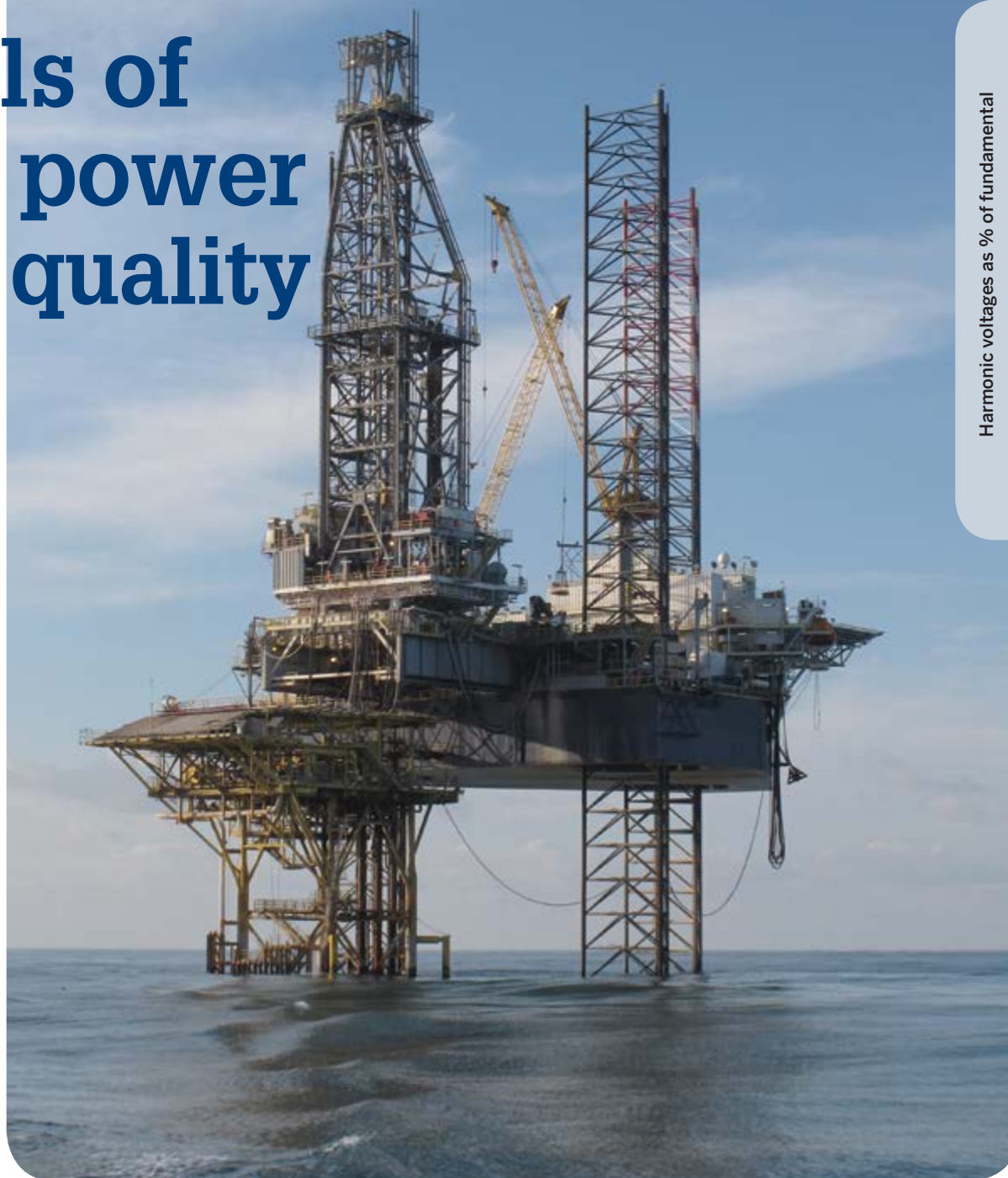
Left: An Ex motor. Above: Typical jackup type drilling rig.

US$100 millions are lost annually across the industry, directly and indirectly, due to poor power quality. The industry is often unaware of where the damage or disruption to equipment